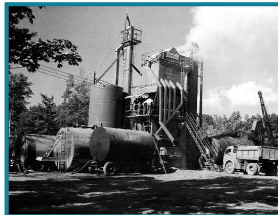
1950's ERA Batch Plant