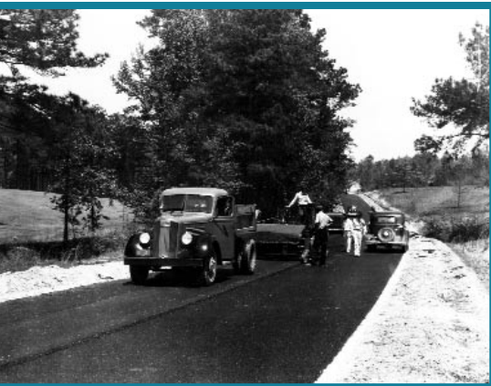
Paving in the 1930's

I went on to become a Resident Engineer with Caltrans. At first, I did a lot of what we called "squirt and splatter" jobs. It was actually a penetration treatment. You put down a granular material, compacted it and then sprayed a cutback asphalt over the surface and allowed it to penetrate. Then came road mix jobs where asphalt was added to a sized-windrow of granular material, mixed in place, spread with a blade, and compacted. After working for a while as a Resident Engineer, Caltrans tapped me as a Field