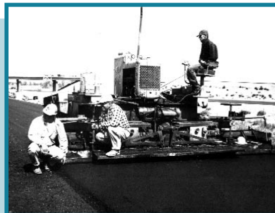
Paving in the 1950's