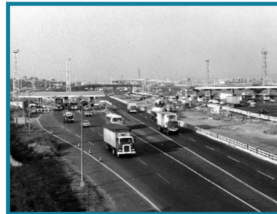
New Jersey Turnpike Circa 1960