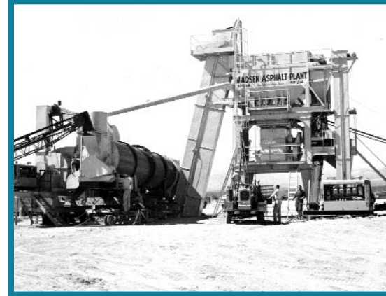
Madsen Batch Plant Circa 1960

Editor's Note: The next article in this series will feature the experiences of an Asphalt Institute engineer whose work covered the early days of HMA.