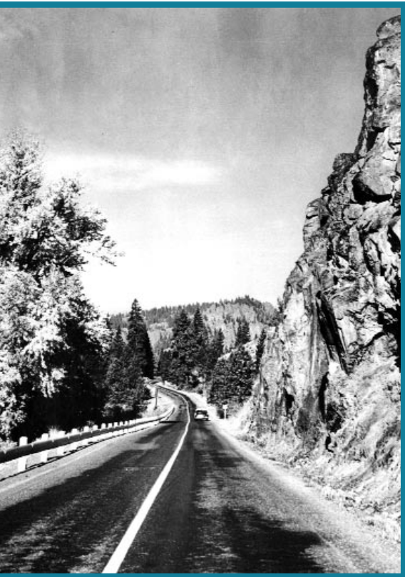
Circa 1950 Asphalt Surface Treatment

So the success of this experimental open-graded mix was really unintentional?