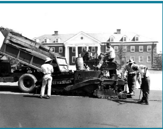
1950's Barber-Greene Paver. Former Asphalt Institute Headquarters, College Park, Maryland, is in the background.