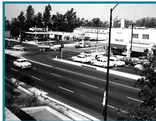
Late 1950's Multi-Lane Pavement

Many think that the use of surge bins began in the late 1960s, but they were in use years before that. In 1946 or '48, the contractor put a surge bin on a continuous mix plant working in the Mojave Desert because he was a little short on trucks. As you know, continuous plants run all the time whether there is a truck there or not. So he figured out that he better have a place to store some mix without having to stop the plant. The bin would hold, I think, 20 to 25 tons. It wasn't a big one and it was square. We were loading trucks out of that bin almost 20 years before the common use of surge bins.