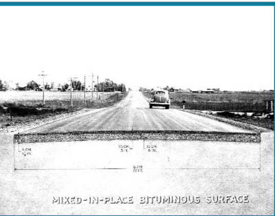
Mixed In-Place Bituminous Surface