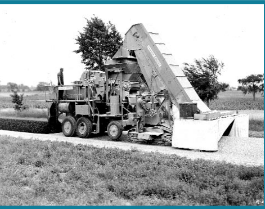
Barber Green "Mobile Automatic Mixer"